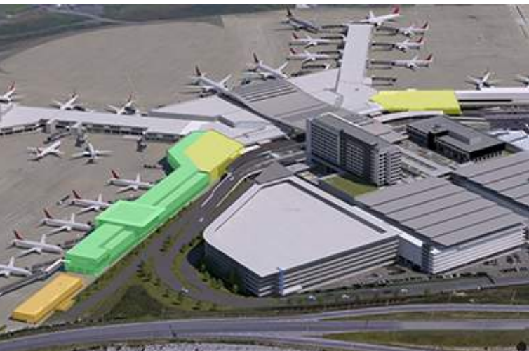
Concourse D Terminal Wings Central Utility Plant