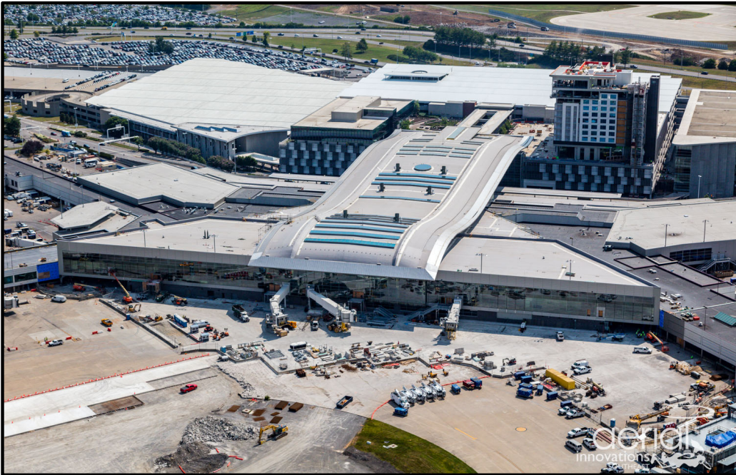
Marketplace & International Arrivals Facility Monday, September 25, 2023 $ 480,436,795