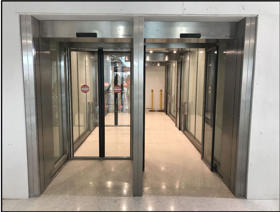
Dormakaba Security Exit Breach Control