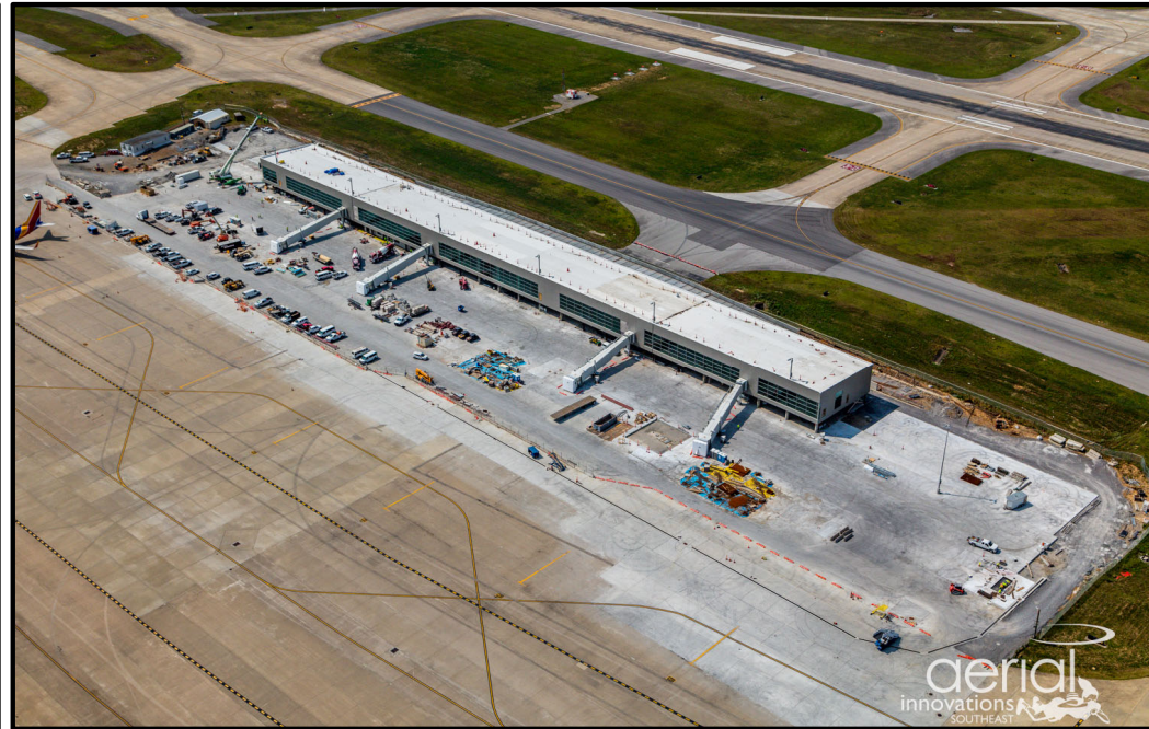
Satellite Concourse Thursday, October 19, 2023 $134,500,000 ($33M from State of TN)