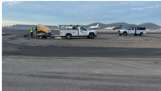
Hangar 1, 1/8/24