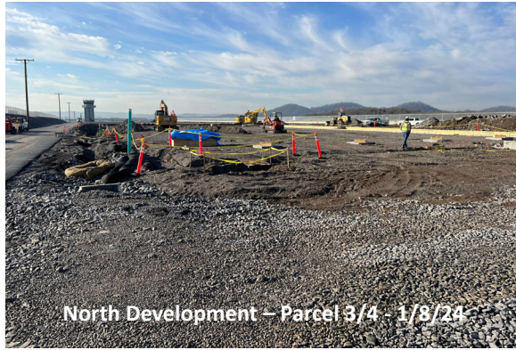
North Development – Parcel 3/4 - 1/8/24