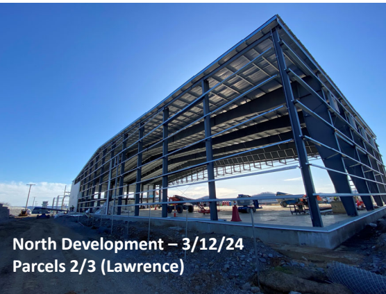
North Development – 3/12/24 Parcels 2/3 (Lawrence)