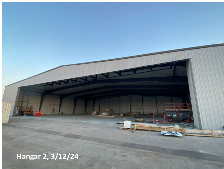
Hangar 2, 3/12/24