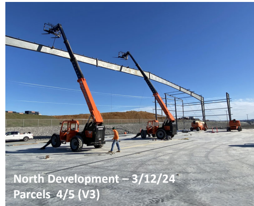
North Development – 3/12/24 Parcels 4/5 (V3)