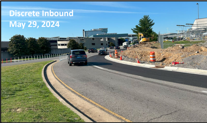
Discrete Inbound May 29, 2024