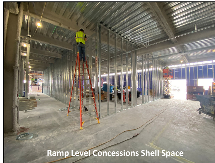
Ramp Level Concessions Shell Space