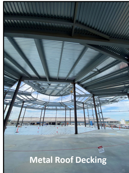
Metal Roof Decking